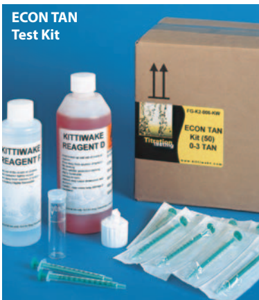
ECON TAN Test Kit

Testing for TAN is essential to maintain and protect your equipment, preventing damage in advance.