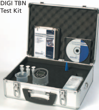
DIGI TBN Test Kit

Measure your oil's alkaline reserve and ability to neutralise acids from combustion.